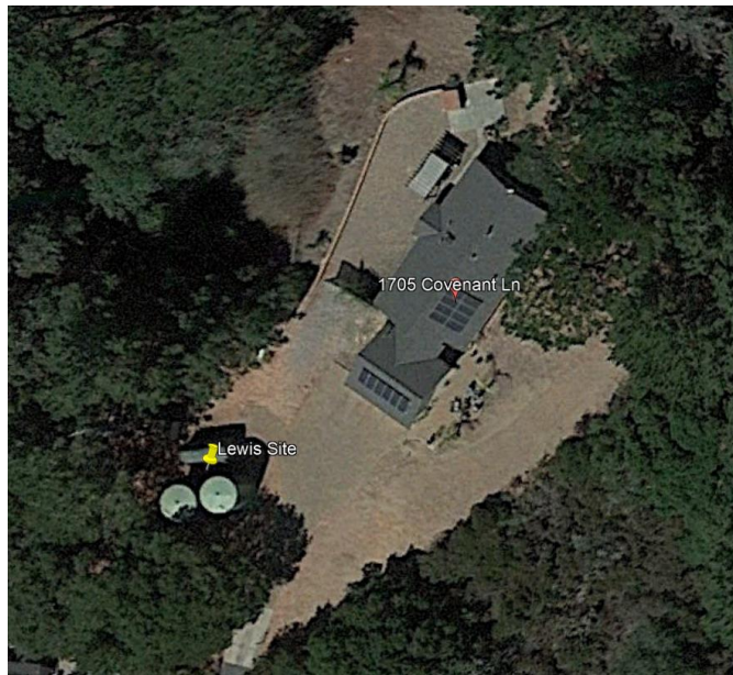
Figure 1 - Lewis Site on 1705 Covenant Ln Plot