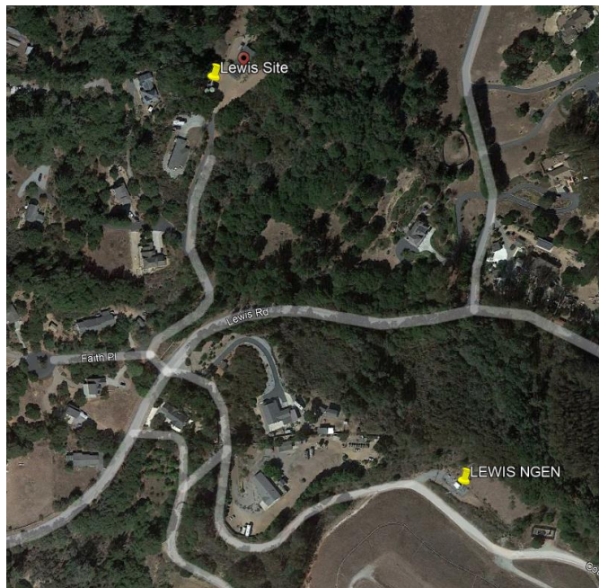
Figure 2 - Lewis Rd Site relative to Lewis Rd and NGEN Site