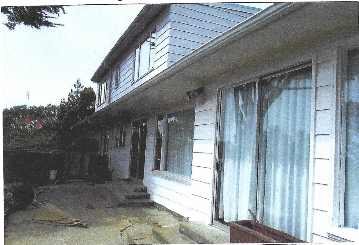
Photo #2. Looking NW at the South facing rear elevation, note complete metal window replacement on this elevation, Kent Seavey, May, 2022.