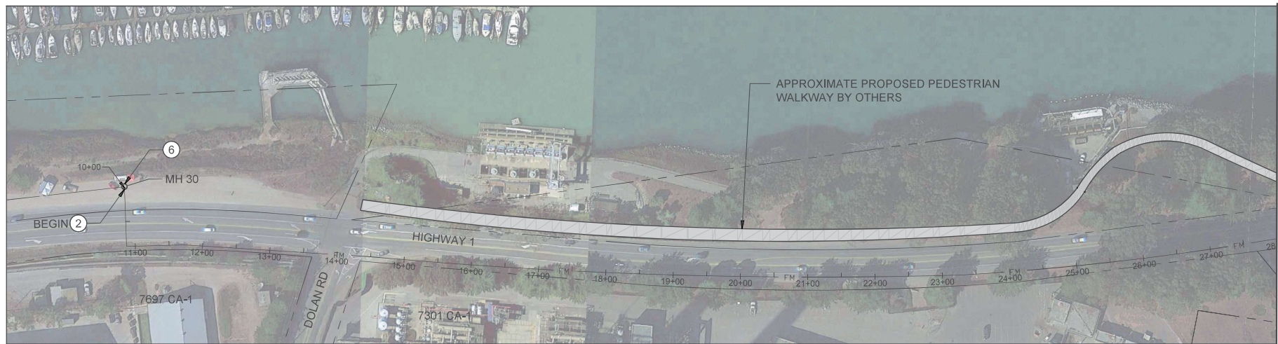
FORCE MAIN REHABILITATION AND DISCHARGE REPLACEMENT 1" = 100' R.