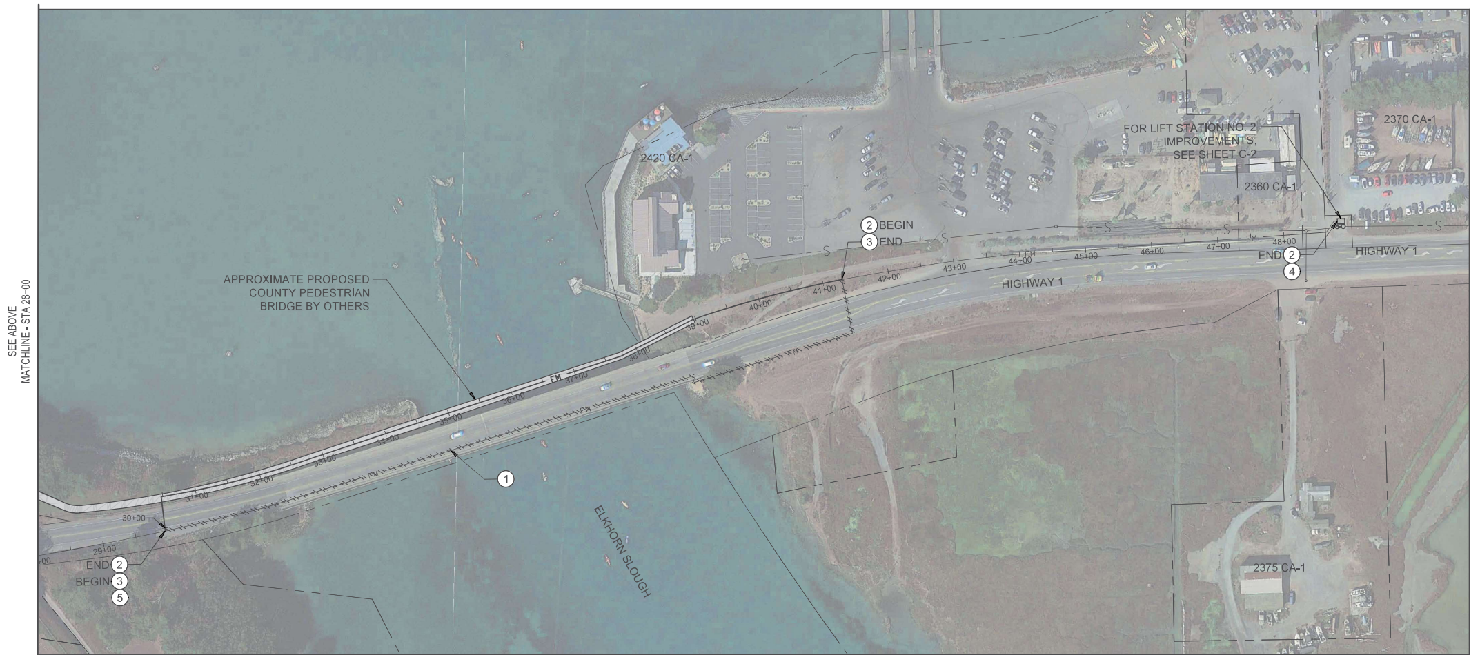
FORCE MAIN REPLACEMENT AND REHABILITATION 1" = 100' R.