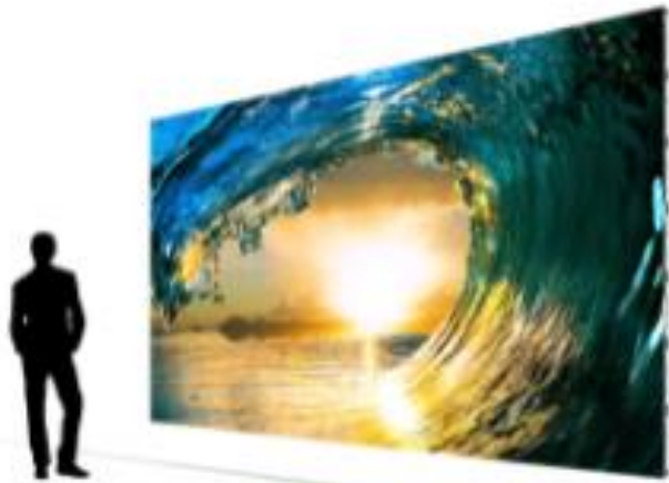
LED Video Wall