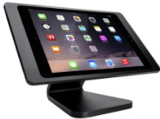
Touchscreen on dais

Conveniently located outlets on dais & public seating