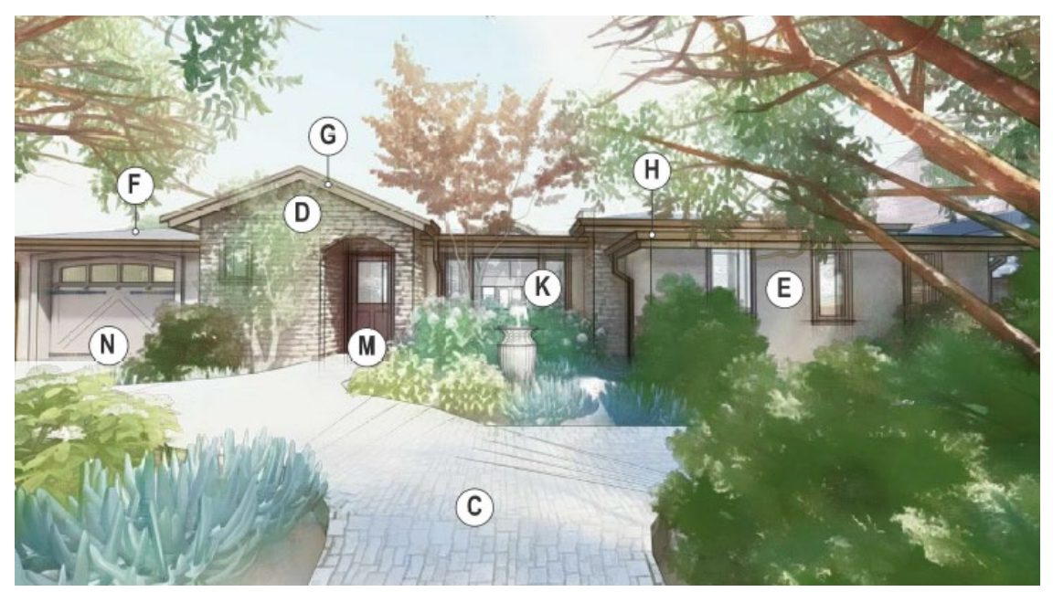
Figure 3: Color and Materials Rendering