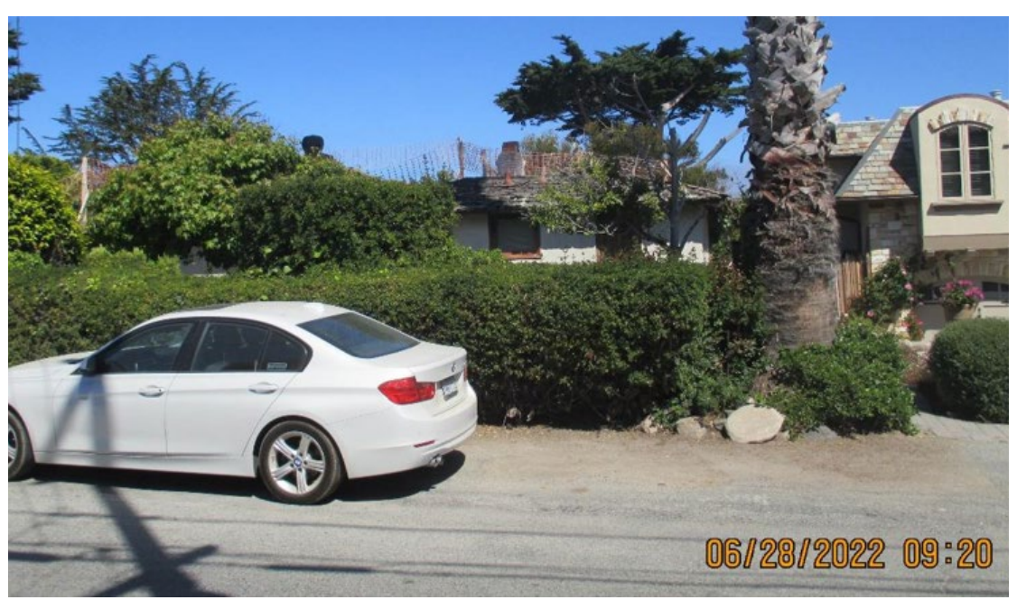
Figure 2: Photo showing staking and flagging in comparison to neighboring residence

The site is approximately 150 feet southeast of Scenic Road and 220 feet southeast of Carmel Beach, both nearby recreational destinations that serve as public viewing areas. However, due to existing homes on Scenic Drive the home is not visible from these vantage points and could therefore not cause an adverse visual impact when viewed from a common public viewing area.