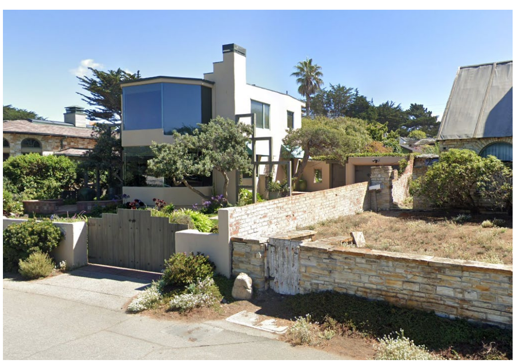
Figure 6: Google Street View image from Scenic Road oriented toward project site (accessed September 2022)