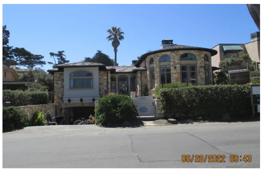
Figure 5: Photo taken from Scenic Road oriented to project site