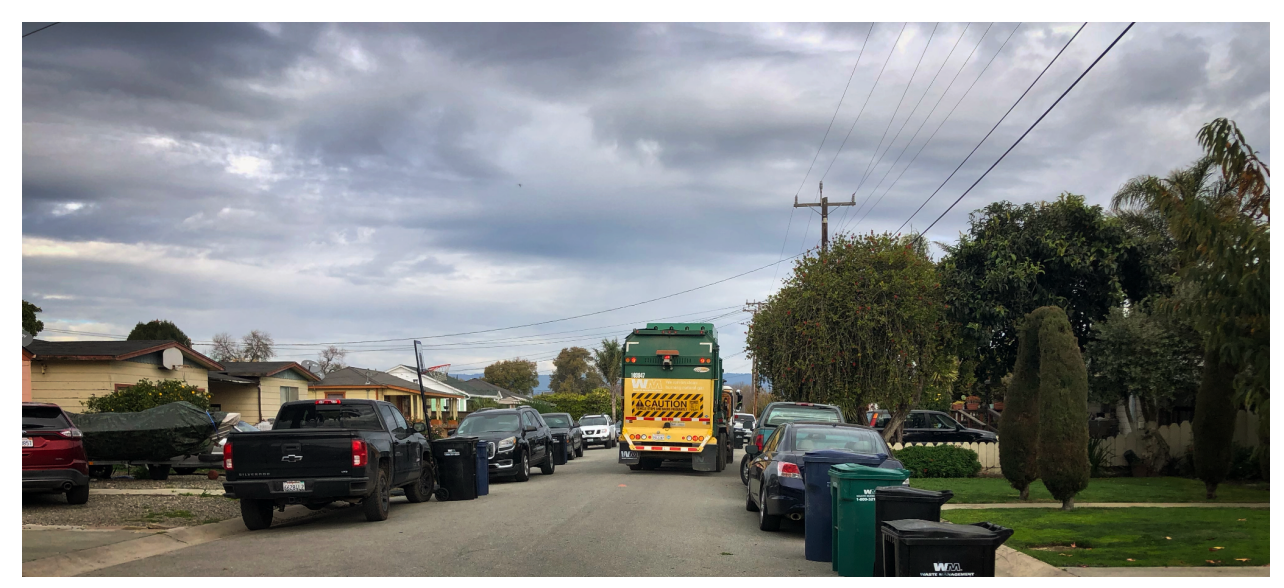
Susan Street Monday, January 17, 2022

Our community is not anti-development, not in the slightest, but this is not a good fit. The neighborhoods, density, lack of parking and infrastructure is not appropriate.