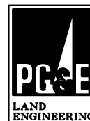
EXHIBIT "A" SALINAS 1104 RELOCATION S. DAVIS RD. WIDENING MONTEREY COUNTY, CALIFORNIA PACIFIC GAS AND ELECTRIC COMPANY San Francisco California

PROJ. NO. 3, CENTRAL COAST AREA MONTEREY COUNTY 1 INCH = 200 FEET SCALE SHEET NO. 1 OF 1 DRAWING NUMBER CHANGE L-10201 0