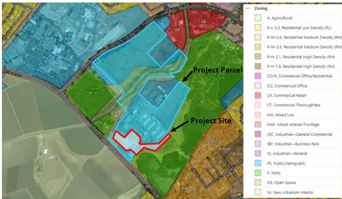
Figure 3. Zoning Map