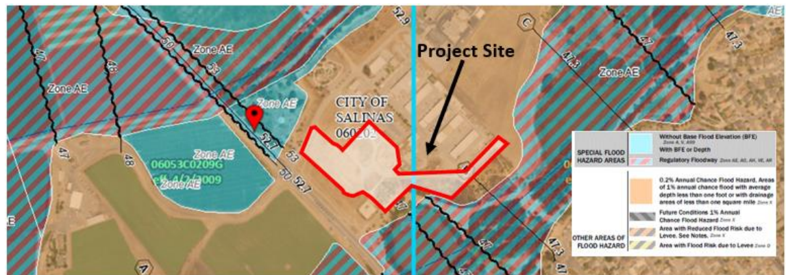
Figure 5. FEMA Floodplain Map

The other site constraint to consider is the fact that portions of the larger 86.5 acres parcel are partially located within FEMA Floodplain (Special Flood Hazard Area, Zone AE), yet the 9.4 acres of the project site are completely out of the Special Flood Hazard Area as shown in Figure 5. Careful analysis of the site elevation points will be needed to ensure that the future Project will be completely out of Zone AE.