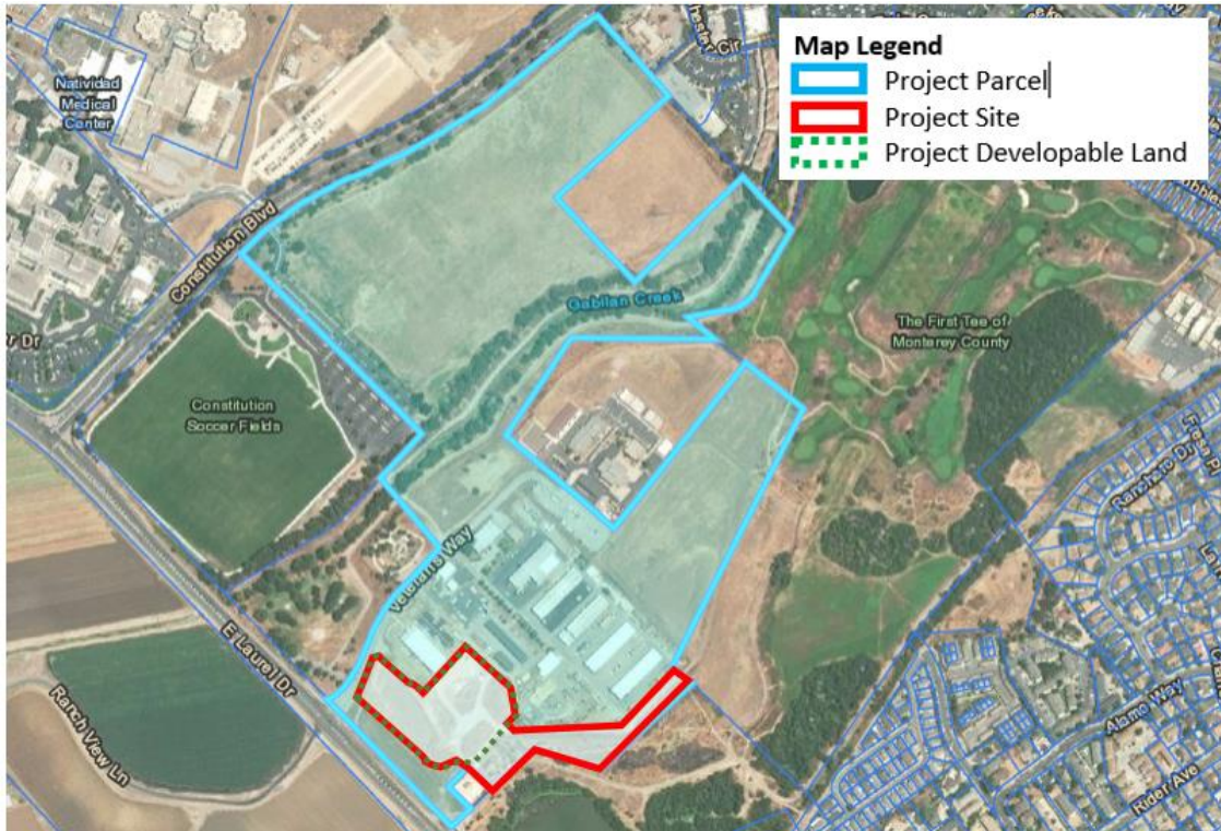
Figure 1. Project Parcel, Site & Developable Land

Regional Occupation Program, First Tee Monterey County and Virginia Rocca Barton Elementary School. To the southeast of the site is the Upper Carr Lake and several residential neighborhoods. There are several large agricultural parcels to the southwest and immediately adjacent to the site. Additionally, the County envisions a Pump Track and Skate Park adjacent to the project site as is notated in Figure 2 .