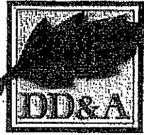
EXHIBIT A-2 – SCOPE OF SERVICES/PAYMENT PROVISIONS