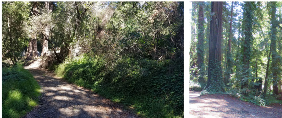
Figure 2. On-Site Vegetation

The Morgenrath property is an oddly-shaped 2.55 acre parcel located on the eastern side of Highway 1. Access to the site is provided by an existing driveway off Highway 1 and a right of way that traverses the property and provides access to nearby parcels. The project specific Geotechnical report describes the property to contain topography with “slight to moderate” slopes at elevations ranging between 180 to 280 feet above mean sea level. The lower elevation of the property is nearest Highway 1 while the higher elevation of the property is generally to the northeast (Source: IX.1 and IX.10). Soils range from fine sand to medium gravel with few amounts of silts and clays. The site is considered to be entirely within a Redwood Forest natural community dominated by coast redwood and co-dominated by California bay laurel. Tan oaks and coast live oaks are present but limited in numbers. Native understory plants are also limited due to invasive English ivy that dominates the understory vegetation ( Figure 2 , Source: IX.9).