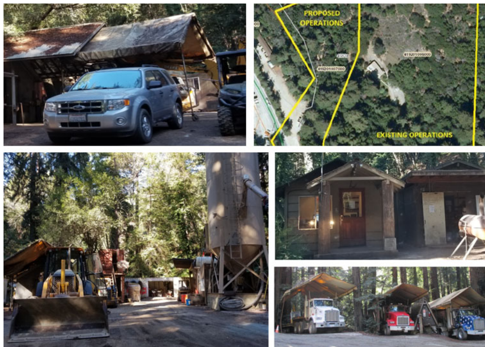
Figure 3. Blaze Engineering Operations on Adjacent Parcel (APN 419-201-006-000)

As previously stated, Blaze Engineering’s operations were conducted from an adjacent property to the east for approximately 28 years ( Figure 3 ). Therefore, as part of the baseline condition of the immediate vicinity, analysis of impacts resulting from the project includes effects to both the physical conditions of the Morgenrath property and the spatial and functional conditions of the area at the time the application for development was made.