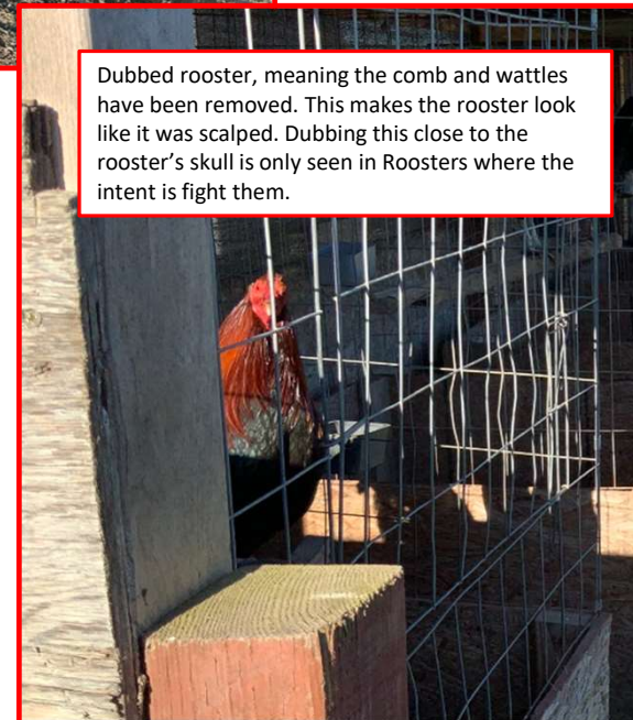
Dubbed rooster, meaning the comb and wattles have been removed. This makes the rooster look like it was scalped. Dubbing this close to the rooster's skull is only seen in Roosters where the intent is fight them.