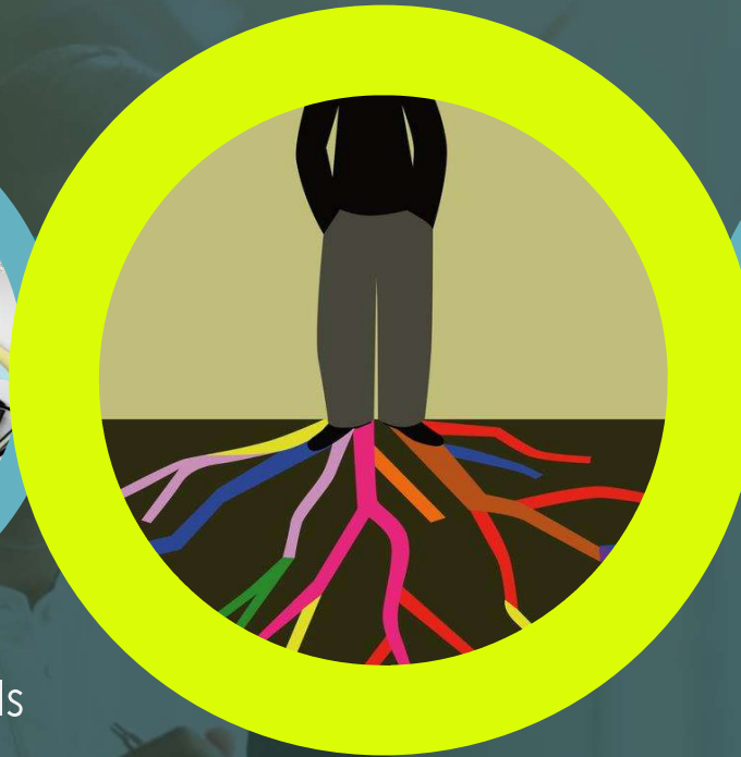
Chief Resilience Officer Management Analyst III $190k Annually; $950,000