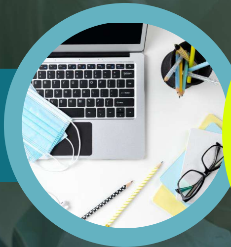
Supplies & Materials $5,000