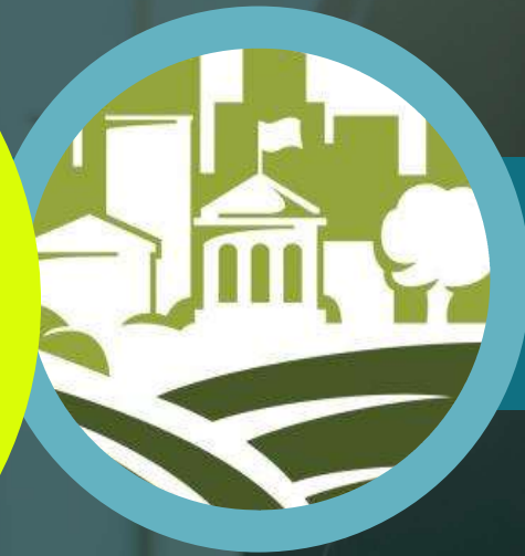
Community Resilience Intern Civic Spark Fellow $25K Annually (1Year)