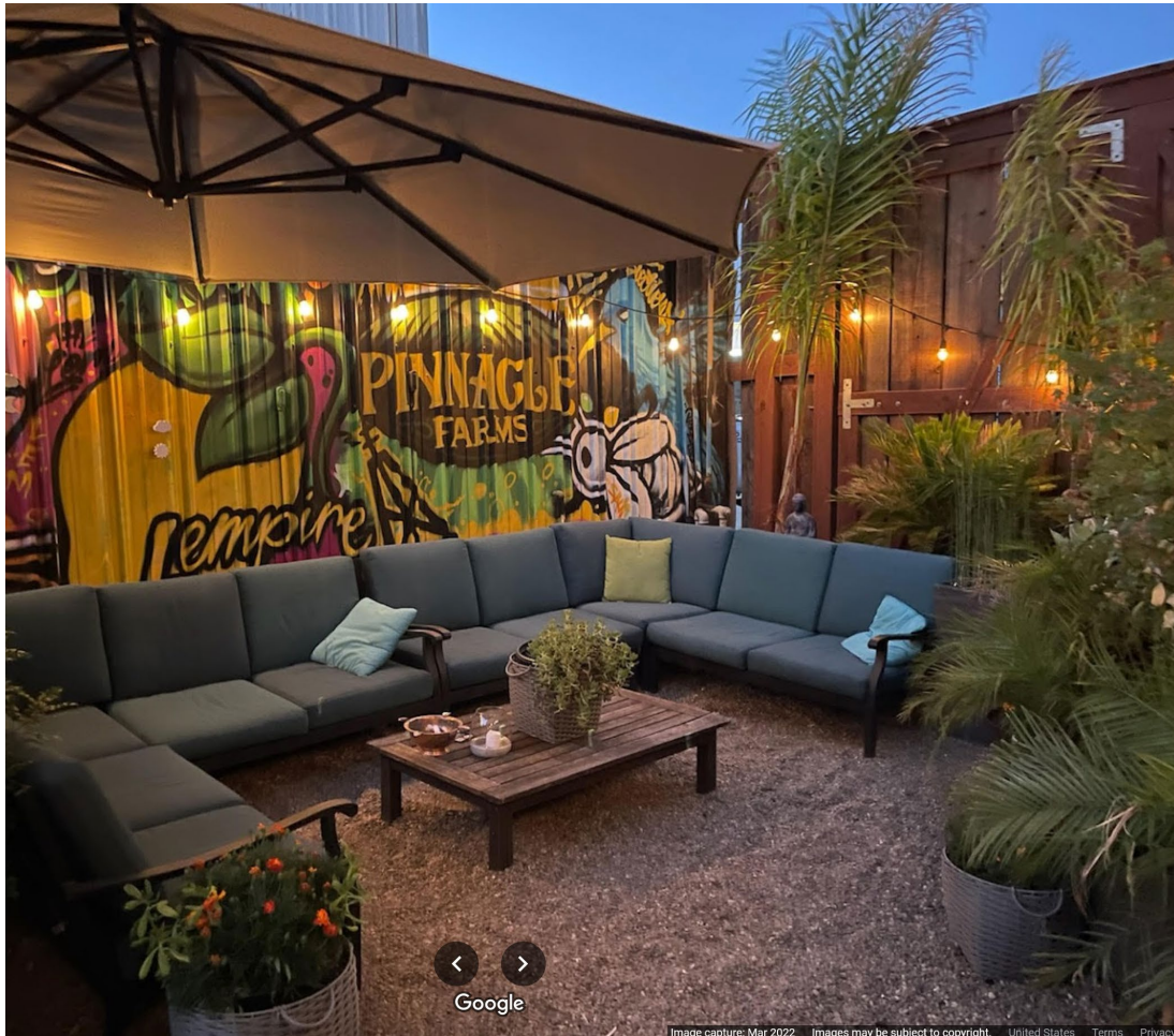
Compassionate Heart, County of Mendocino