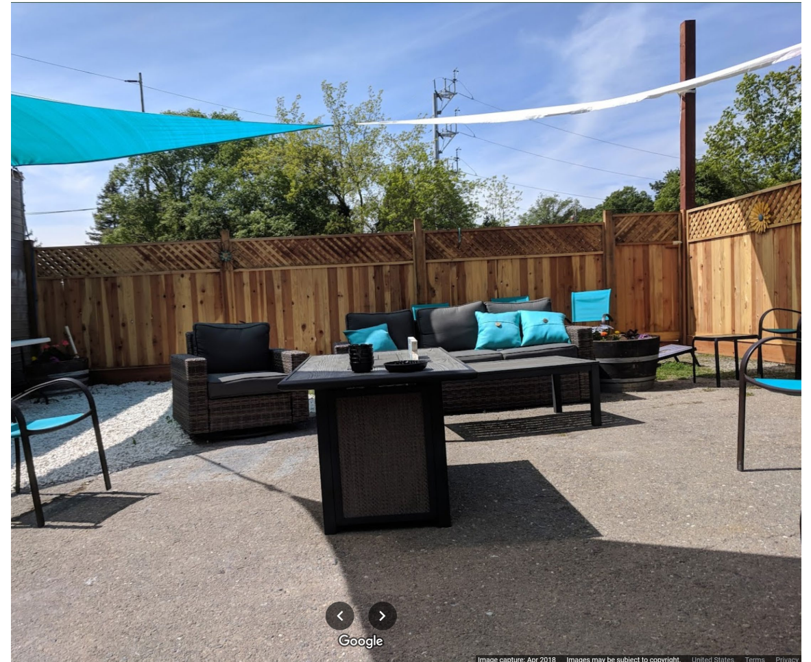
Kure Wellness, County of Mendocino