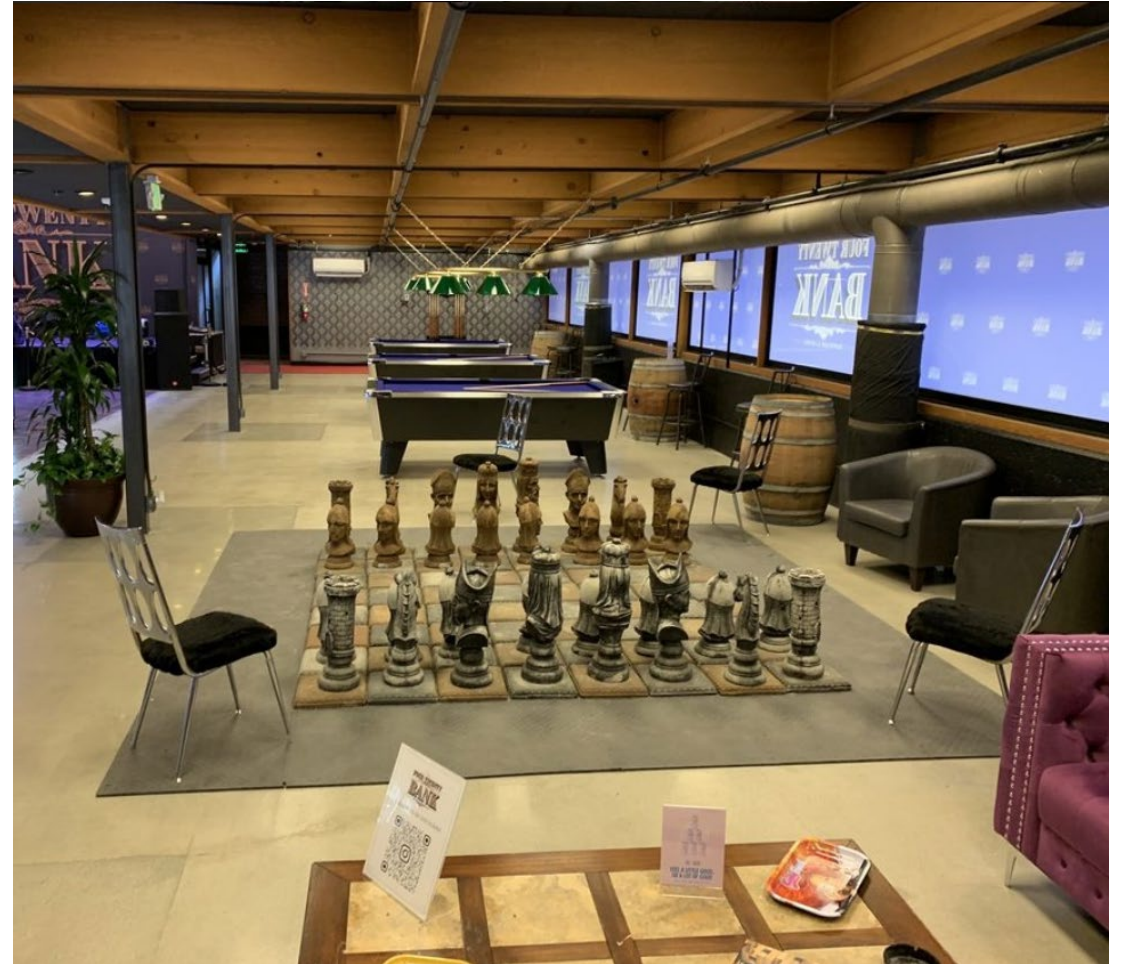
Four Twenty Bank, City of Palm Springs