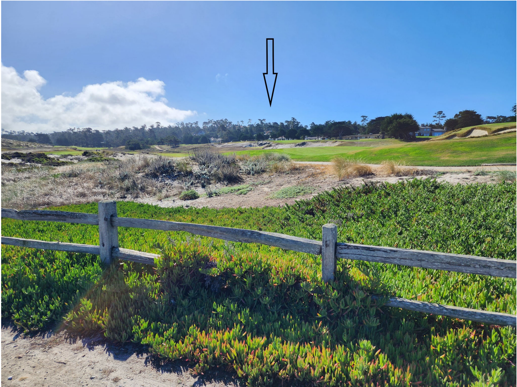
Photograph taken from 17 Mile Drive facing proposed development on October 10, 2023. Staking and flagging is below the arrow.