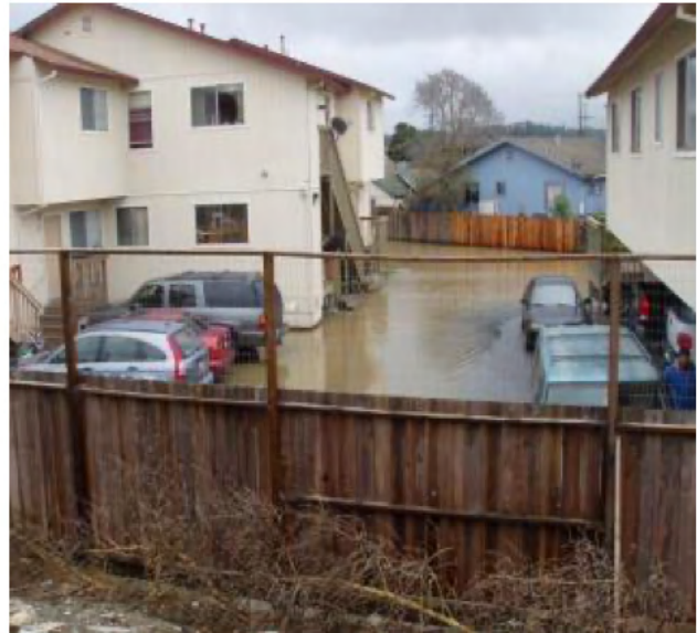
Figure 9: Shallow flooding at the Pajaro River Levee near Gonda Street , March 2011.

Flood damage in Pajaro Valley is caused by the overtopping or destruction of levees resulting in inundation of the floodplain. As provided in the FIS, 100-year flooding velocities range from 1.4 to 10.5 feet per second. The two largest floods on the Pajaro River occurred in 1955 and 1958. The associated discharges on the Pajaro River for these events were 24,000 cfs and 23,500 cfs, respectively, at the USGS Chittenden gage. The estimated return periods for these floods are 27 years and 26 years, respectively. Another severe flood occurred in March 1995, estimated to be a 10-20 year storm event, caused by a breach in the levee approximately 3 miles upstream of the town of Pajaro. The drainage system in the flat town could not adequately discharge the stormwater runoff in the streets. This resulted in mass evacuations and damage to private property. All residences (600+) and businesses in Pajaro were damaged and 2,500 people (out of a total population of 5,000) were evacuated. The peak flow travel times at the USGS Chittenden gage are provided in Appendix B.