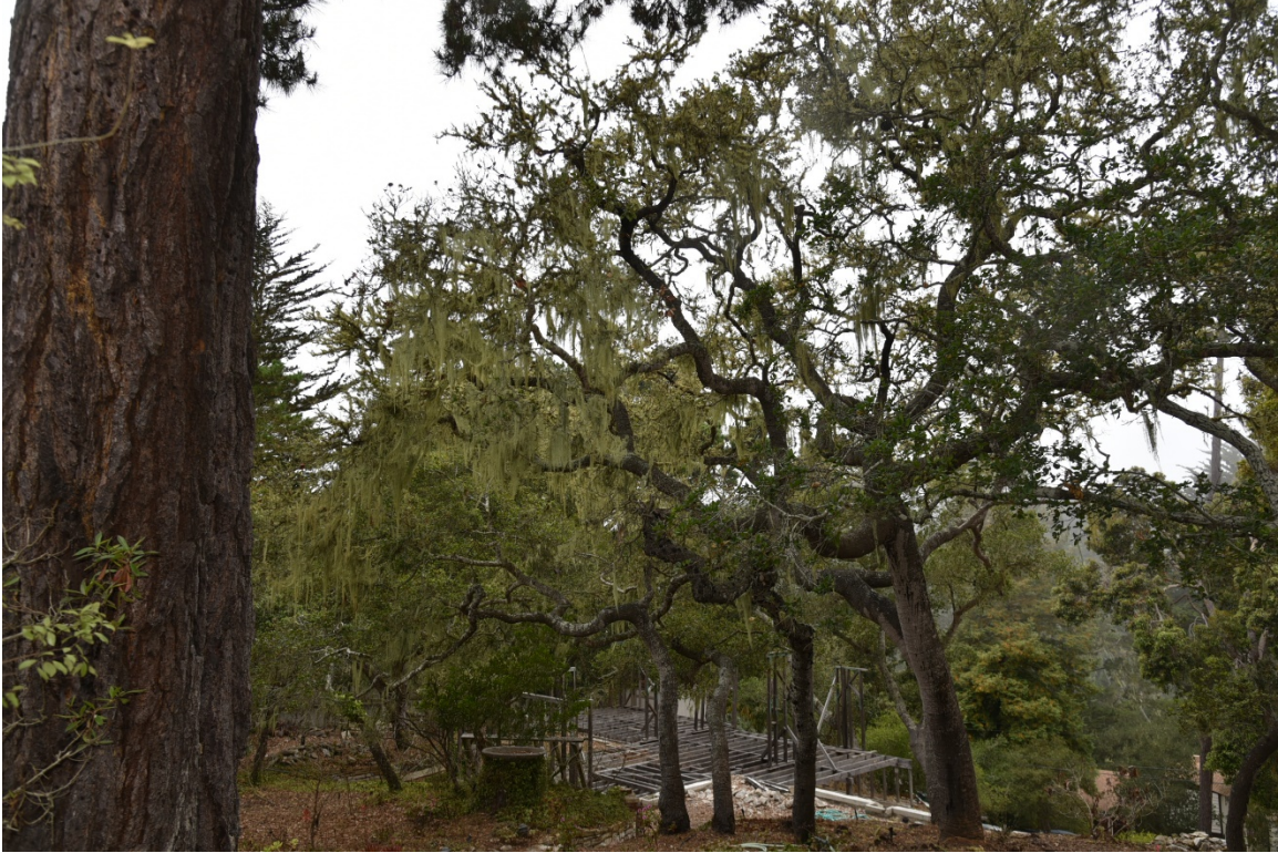
View of site looking west from gate (all trees are in fair to poor condition)