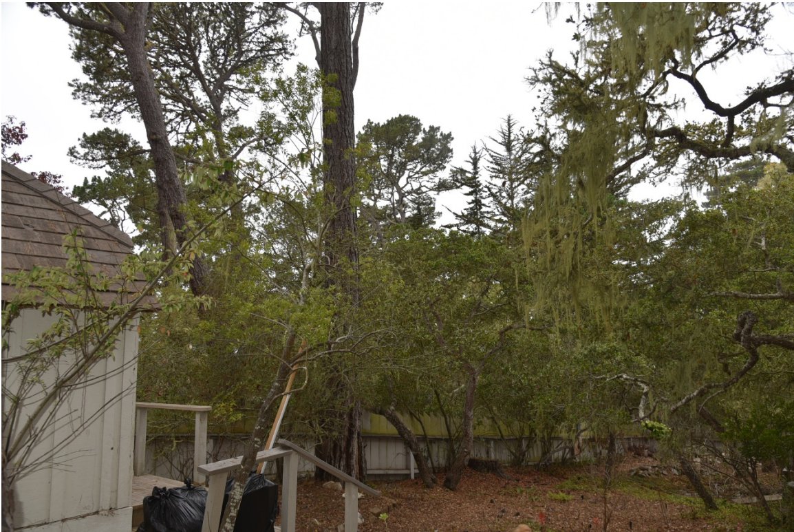
View of site looking south (note defoliation of lower story trees)