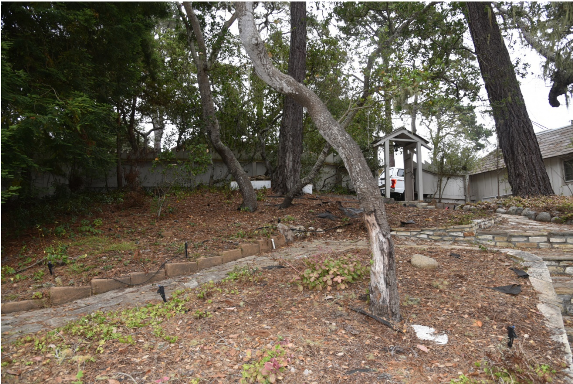
View of site looking north