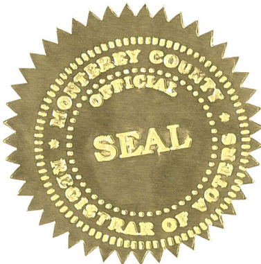
County Clerk/Registrar of Voters County of Monterey State of California

I hereby set my hand and official seal this 22nd day of March , 2024, at the County of Monterey