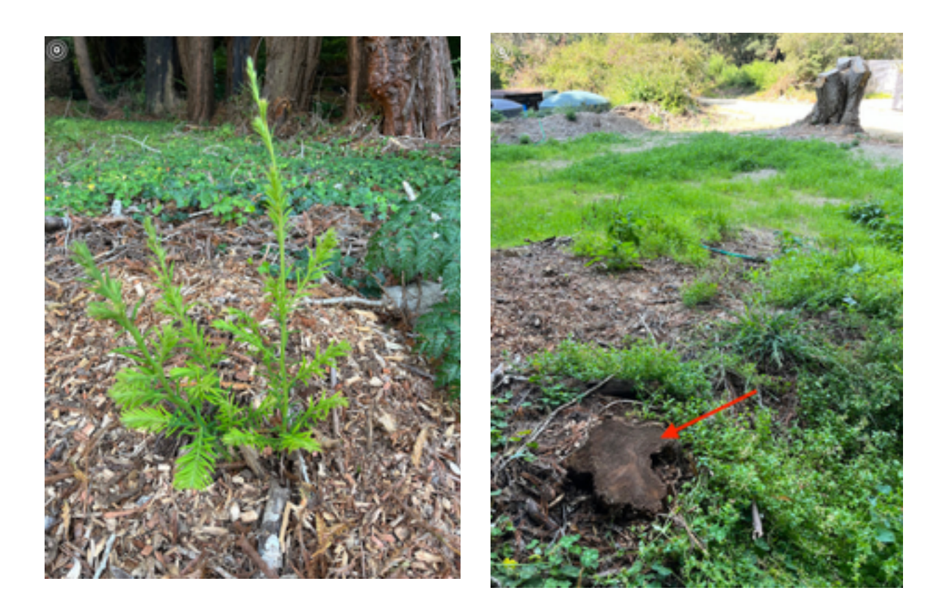
Image 1A (left): Sucker growth off old stump Image 1B (right), stump with no new growth.