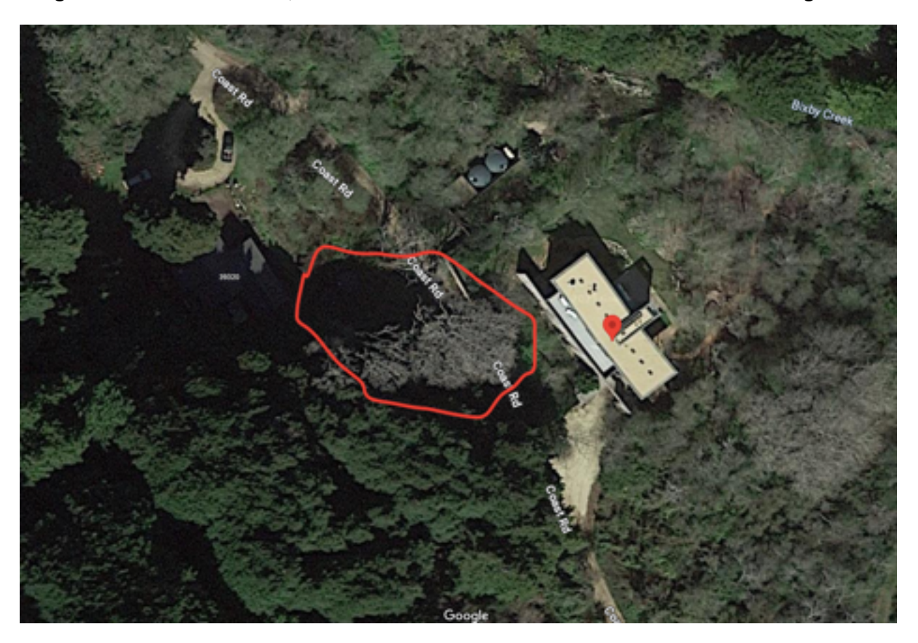
Image 1: Satellite view of site, tree is circled in red. The tree looks to have no live foliage on it.