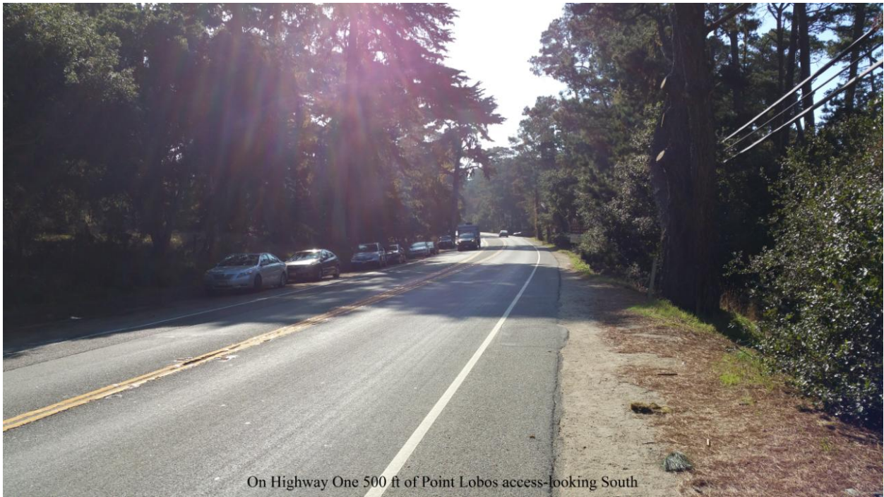
On Highway One 500 ft of Point Lobos access-looking South