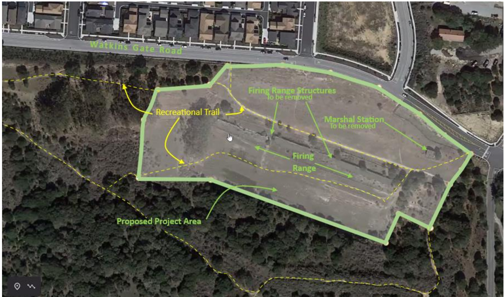
Project Site Map- Former Fort Ord Firing Range and Marshal Station 10 Acre Assessment, Remediation and Restoration Project