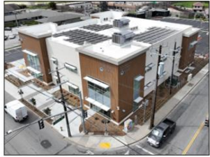
DRAFT County of Monterey Capital Improvement Program Five-Year Plan FYs 2025/26 through 2029/30