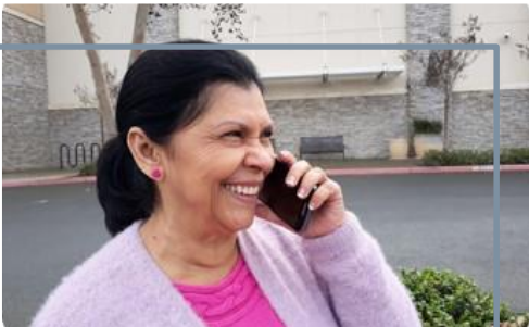
Well Connected – English/Español