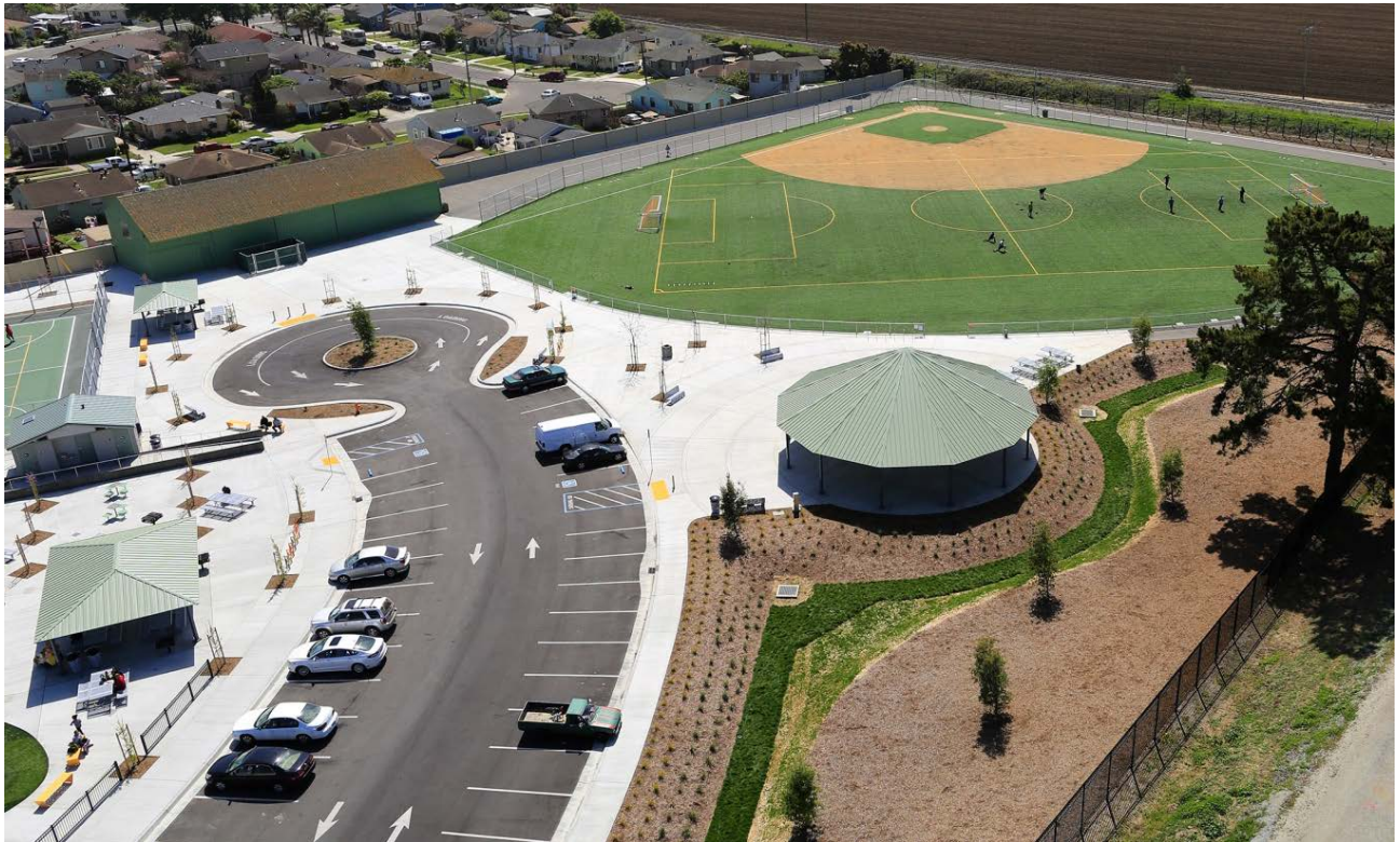
The local YMCA has begun exercise groups at the park on weekdays, averaging 250 people a day. Fitness programs include: Kids Fit, Teen Circuit Training, Walking Together, and Youth Soccer. These fun, healthy alternative activities are helping to prevent youth violence and gang involvement in Pajaro.