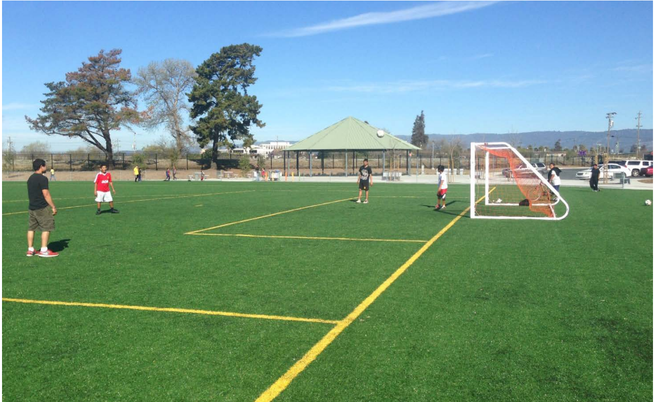
The synthetic turf soccer field has become home to both league games and friendly pick-up matches