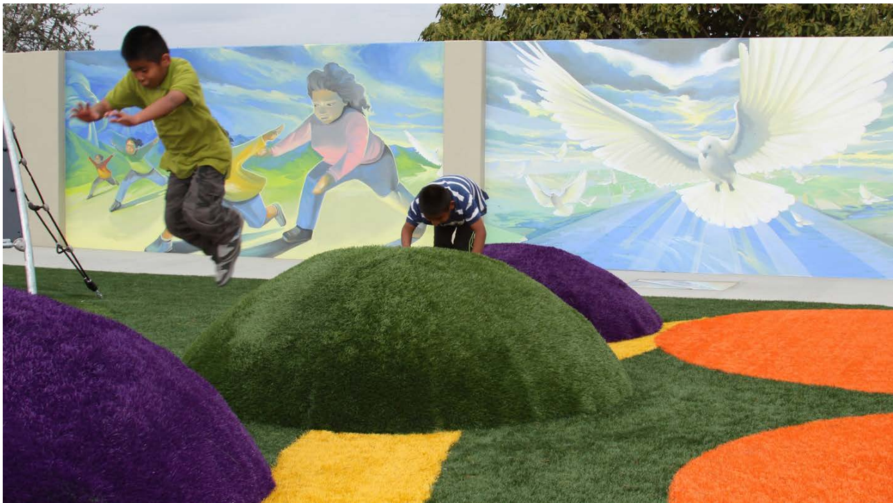
The multi-age playground is made up of brightly colored synthetic turf, play mounds, and modern play equipment.