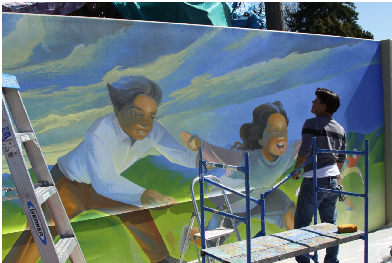
The 300 foot-long mural project is a collaboration between the Monterey Arts Council and Cal State Monterey Bay, who took concepts produced by Ohlone Elementary School and Pajaro Middle School students and transformed them into colorful pieces of art reflecting the culture, environment, and history of the surrounding community.