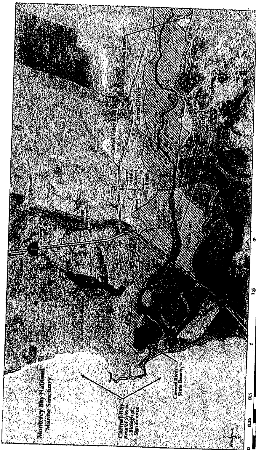
Exhibit 1b: Site Map