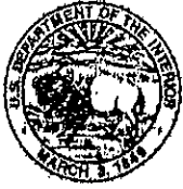
EXHIBIT E – STATE COASTAL CONSERVANCY AGREEMENT NO. 17-024