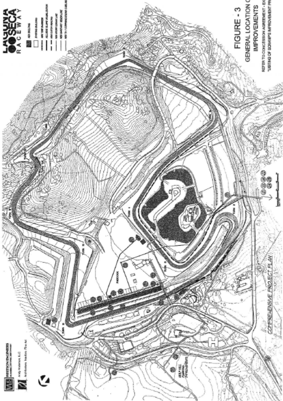
FIGURE - 3 GENERAL LOCATION OF IMPROVEMENTS

REFER TO CONCESSION AGREEMENT - EXHIBIT 'C' LISTING OF SOVIAMPS IMPROVEMENT PROGRAM