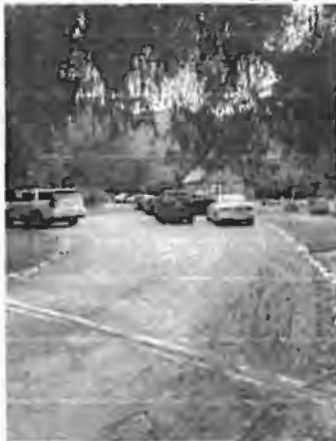
6:00PM: 9 cars