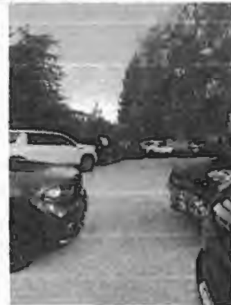
8:00 PM 15 +- cars