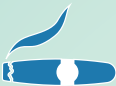
Cigars, Little Cigars/Cigarillos