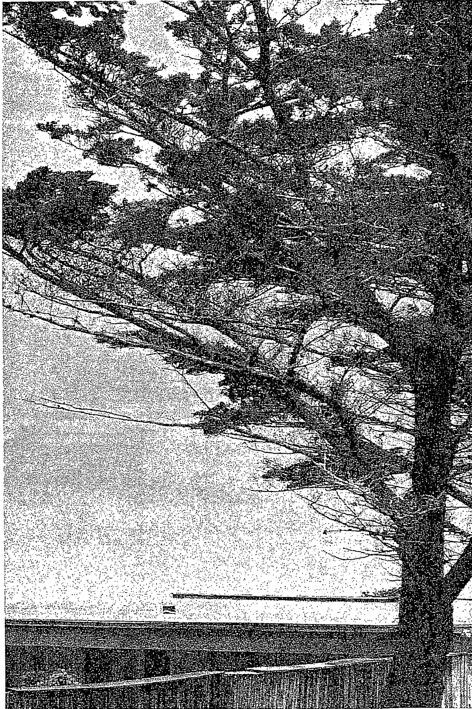
Image 2 Tree 3 Note the dying and dead wood on this tree