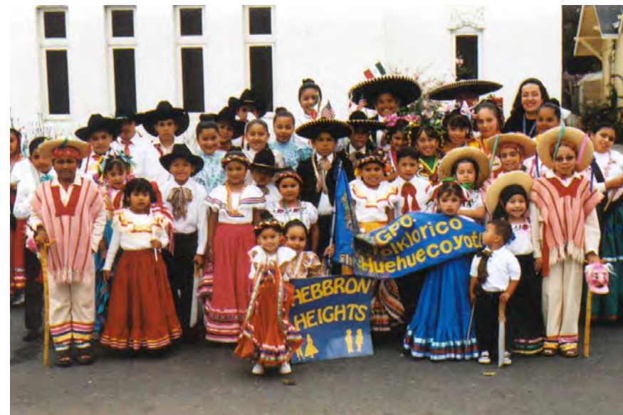
Celebrating local culture is an important aspect of the Salinas community