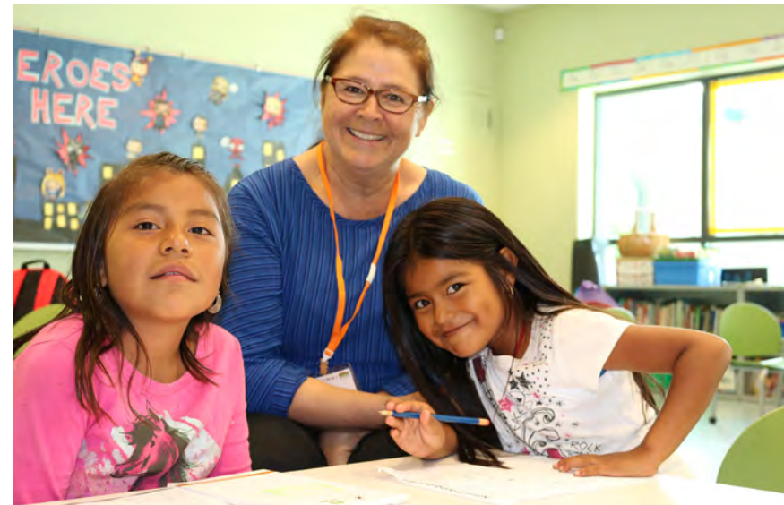
Homework help centers at the library serve many local youth

Support for specific park, recreation, and library system improvements varied between the Spanish and English language surveys. Respondents to the Spanish language survey were notably more likely to support improvements for nature/wildlife watching; playing soccer/lacrosse/football; skateboarding/BMX; homework help centers; makerspaces; and computer or technology labs.