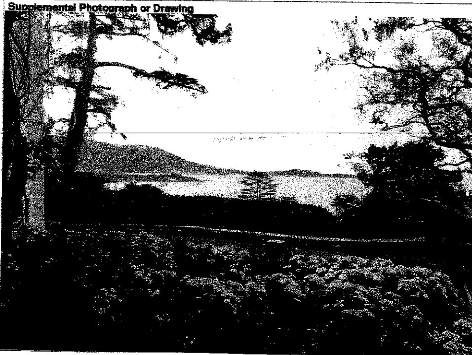
Supplemental Photograph or Drawing