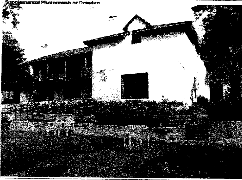
Supplemental Photograph or Drawing