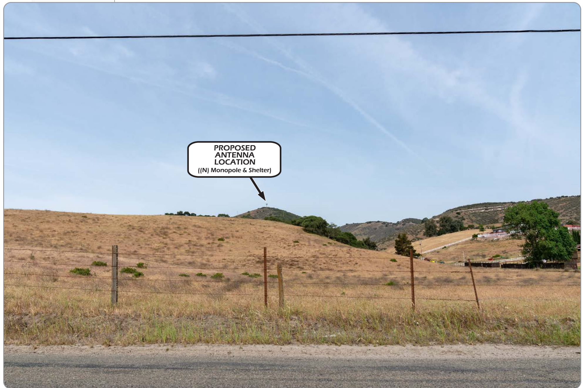
Completed May 13, 2019