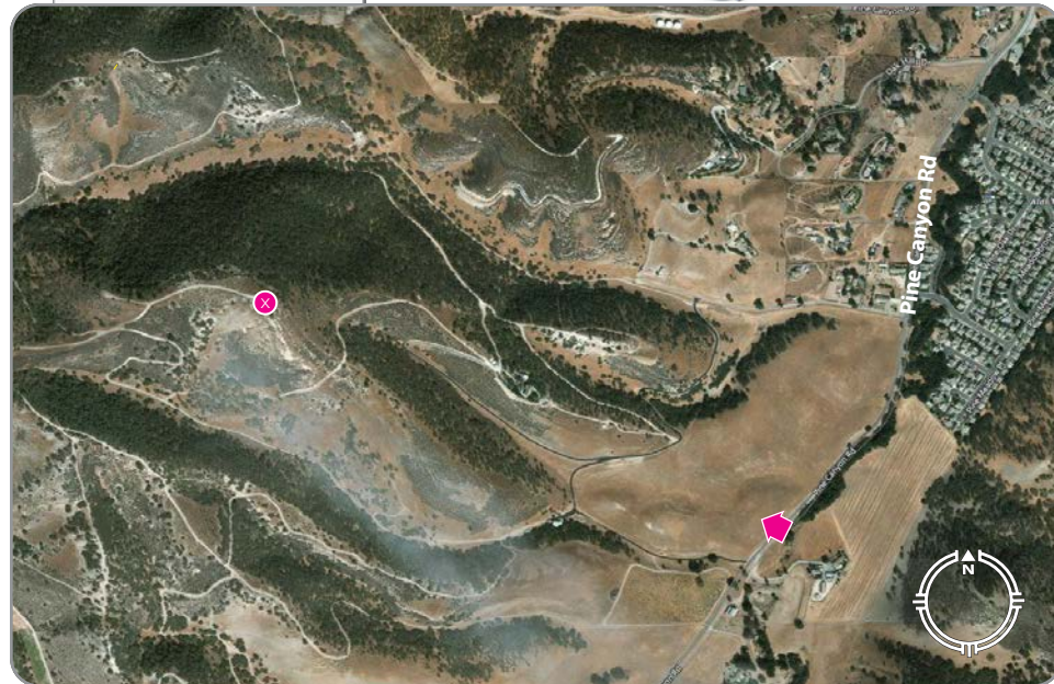
View from the Southeast looking Northwest