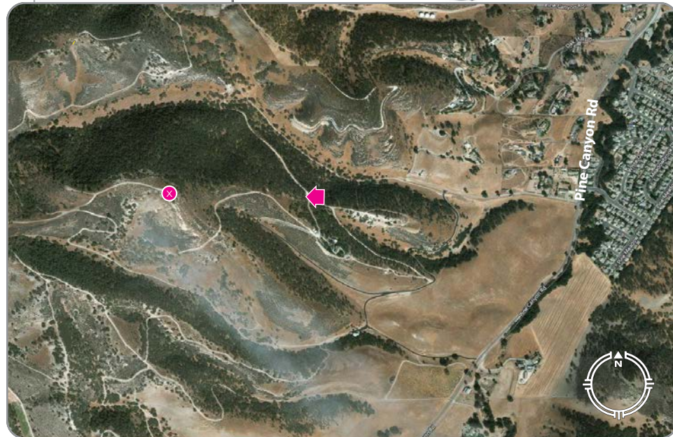
View from the East looking West