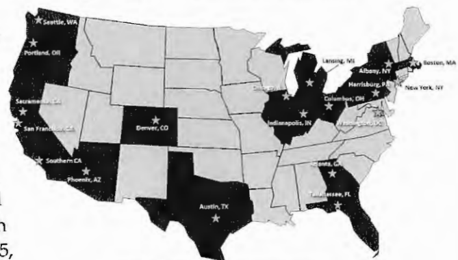
HMA OFFICES ACROSS THE COUNTRY

HMA is a private, for-profit "C" corporation, incorporated in the State of Michigan in good standing and legally doing business as Health Management Associates, Inc. Founded in 1985, Health Management Associates has offices