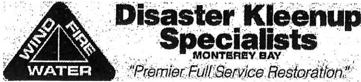
EXHIBIT B - 2 - 2014 PAY RATE