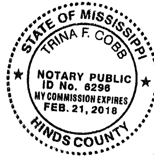
Place Notary Public Seal Above