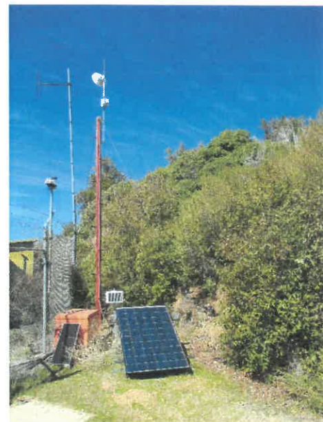
Fac. 8 - Ventana Wildlife Society (R) poles and solar panels are behind VAFB fence.