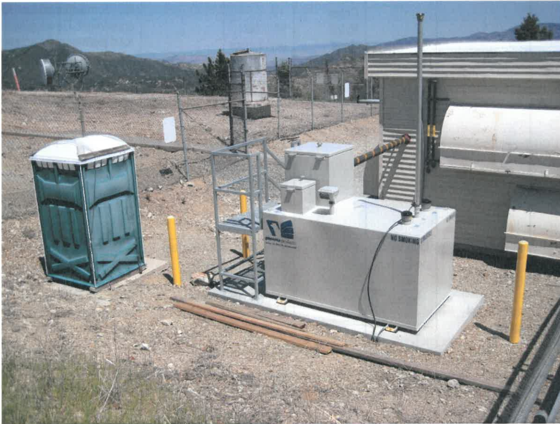
Fac. 1 - FAA building, tower, water tank, rest room, diesel tank