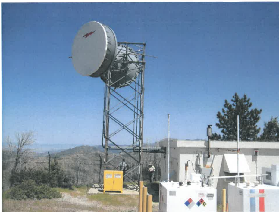
Fac. 4 - Pacific Bell Telephone Co. (AT&T)