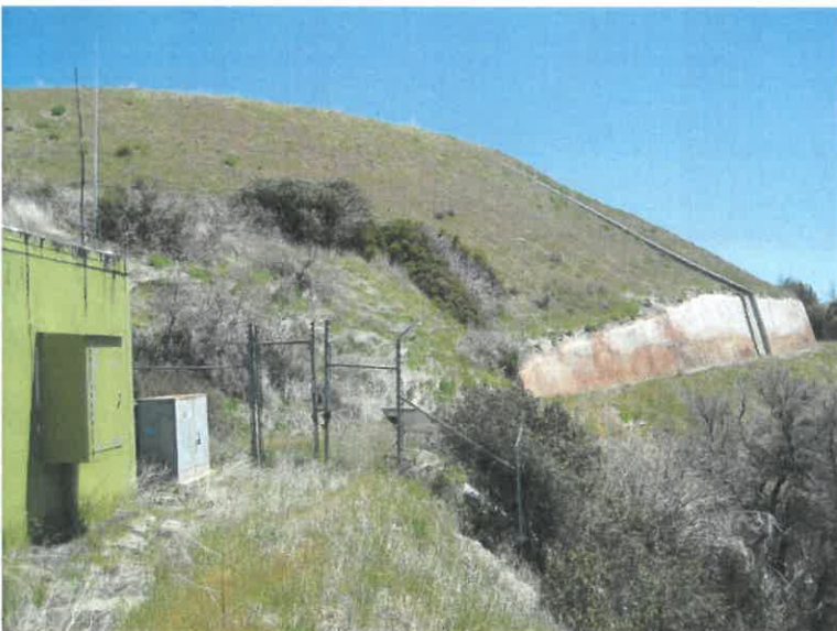
Fac. 7 - VAFB building (L) with FAA retaining wall and culvert below VORTAC facility on top of hill.