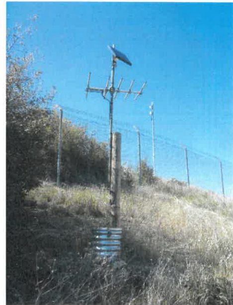
Fac. 5 - USGS seismic monitor near FAA