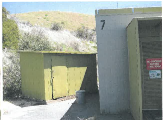
Facility 7 - VAFB Facilities