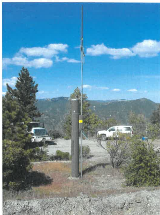
Fac. 2 & 3 - Monterey Co. and CHP poles by FAA bldg. Fac. 6 - Monterey Co. Water Resource Agency