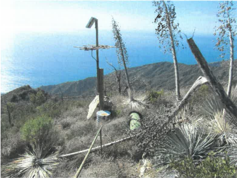
Fac. 5 - USGS seismic monitor below VAFB facility