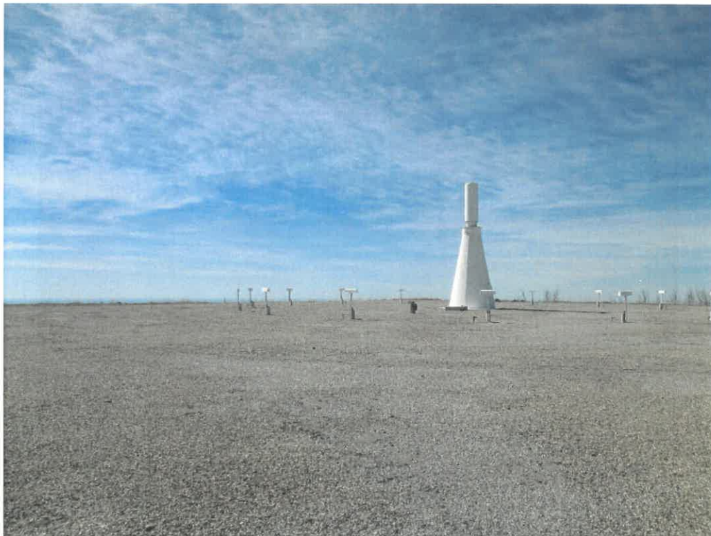
Fac. 1 - FAA VORTAC facility