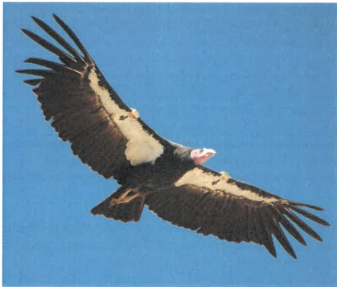
Exhibit 4: Condor Identification