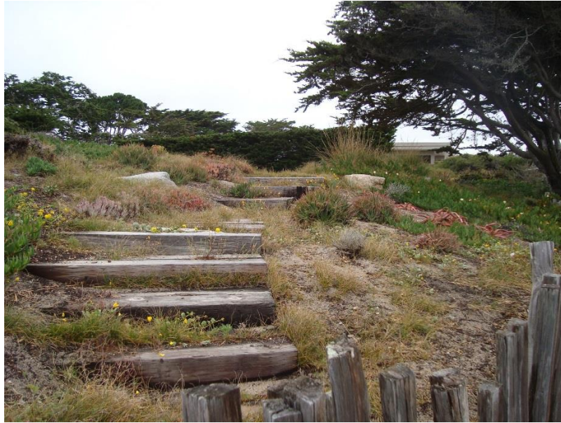
Figure 3. View of dune scrub revegetation/enhancement area showing sparse native cover and presence of non-native plant species, June 2022