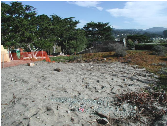
Figure 5. View of disturbed sandy area near western property line.

A portion of the property has been disturbed, as evidenced by open, disturbed sand. This area is located along the western property line. No vegetation was observed in this area, as depicted on Figure 5.