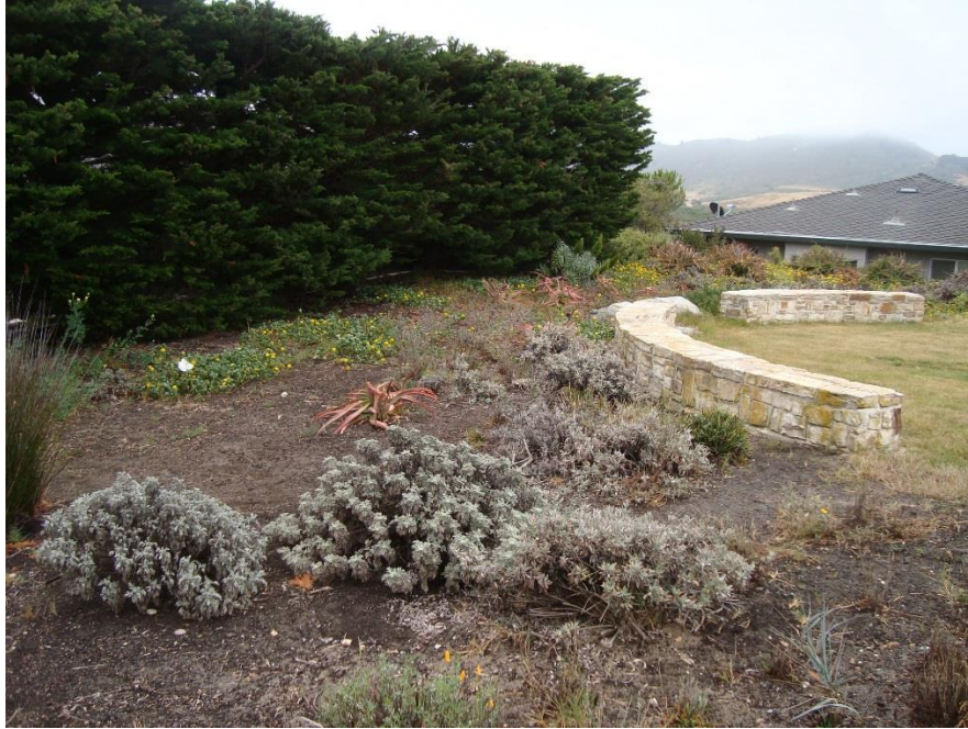
Figure 1. View southeasterly of proposed ADU construction area, June 2022

The character of the proposed ADU construction area is depicted in Figures 1 and 2.