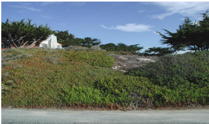
Figure 4. View of remnant dune scrub and iceplant vegetation along southwestern property line (along Scenic Road).

The variety of wildlife species that inhabit the remnant dune scrub at this site is expected to be low due to the arid soils and patchy habitat. Common species such as white-crowned sparrow ( Zonotrichia leucophrys ) and deer mouse ( Peromyscus maniculatus ) may forage for seeds in this habitat, Anna's hummingbird ( Calypte anna ) may find nectar on some plants, and western fence lizard ( Sceloporus occidentalis ) may forage on insects. Special status wildlife species that are associated with dune scrub habitat include Smith's blue butterfly ( Euphilotes enoptes smithi ) and black legless lizard ( Anniella pulchra nigra ); however, the conditions at the Reynolds property are not likely to support either of these species.