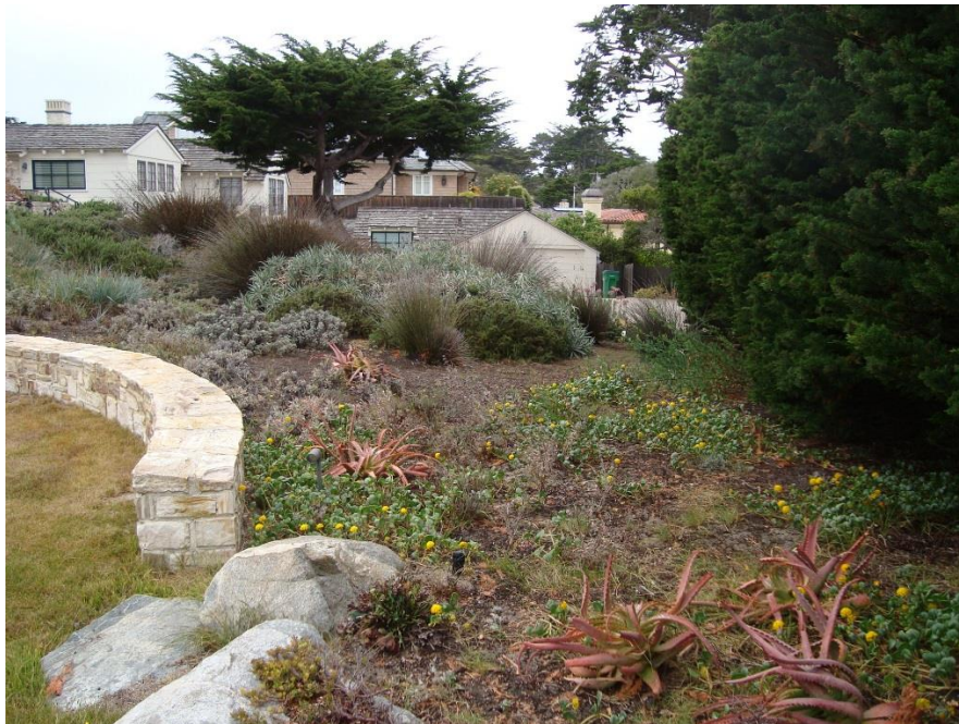
Figure 2. View northwesterly of proposed ADU construction area, June 2022