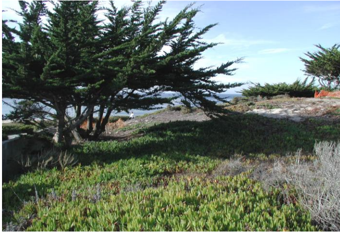
Figure 3. View of Monterey Cypress grove along eastern property line.