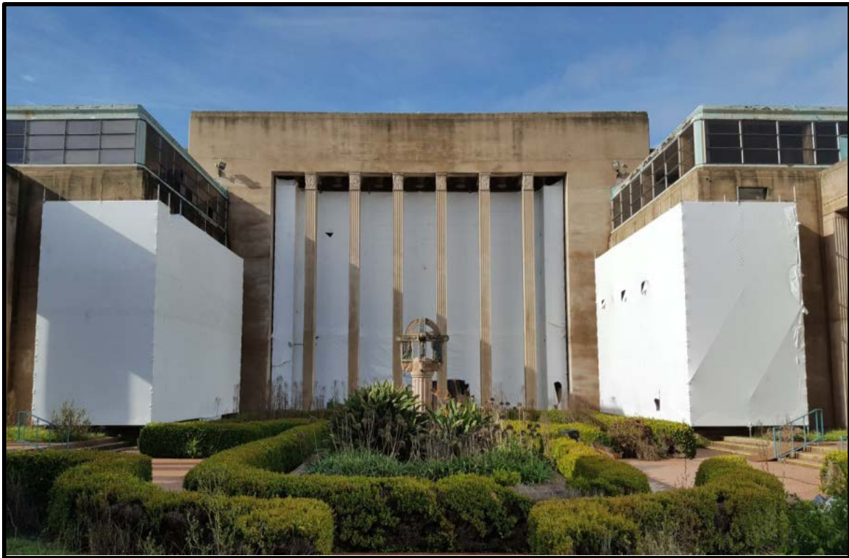
MCGC East & West Wings Renovation