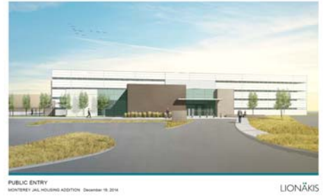
PUBLIC ENTRY MONTEREY JAIL HOUSING ADDITION December 16, 2014 LIONÄKIS

Project # 8819 Project Name Jail Housing Addition