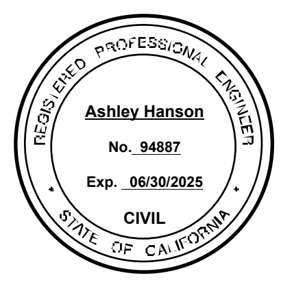
REGISTERED CIVIL ENGINEER

FOR USE IN CONNECTION WITH STANDARD SPECIFICATIONS 2023, THE STANDARD PLANS 2023, THE CURRENT LABOR SURCHARGE EQUIPMENT RENTAL RATES, OF THE STATE OF CALIFORNIA, DEPARTMENT OF TRANSPORTATION, BUSINESS AND TRANSPORTATION AGENCY; THE CURRENT GENERAL PREVAILING WAGE DETERMINED BY THE DIRECTOR OF INDUSTRIAL RELATIONS IS ON FILE WITH THE DEPARTMENT OF PUBLIC WORKS.