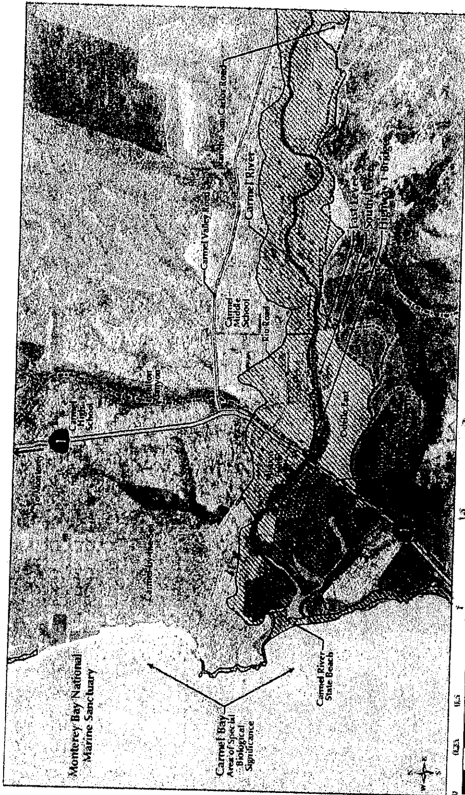
Exhibit 1b: Site Map