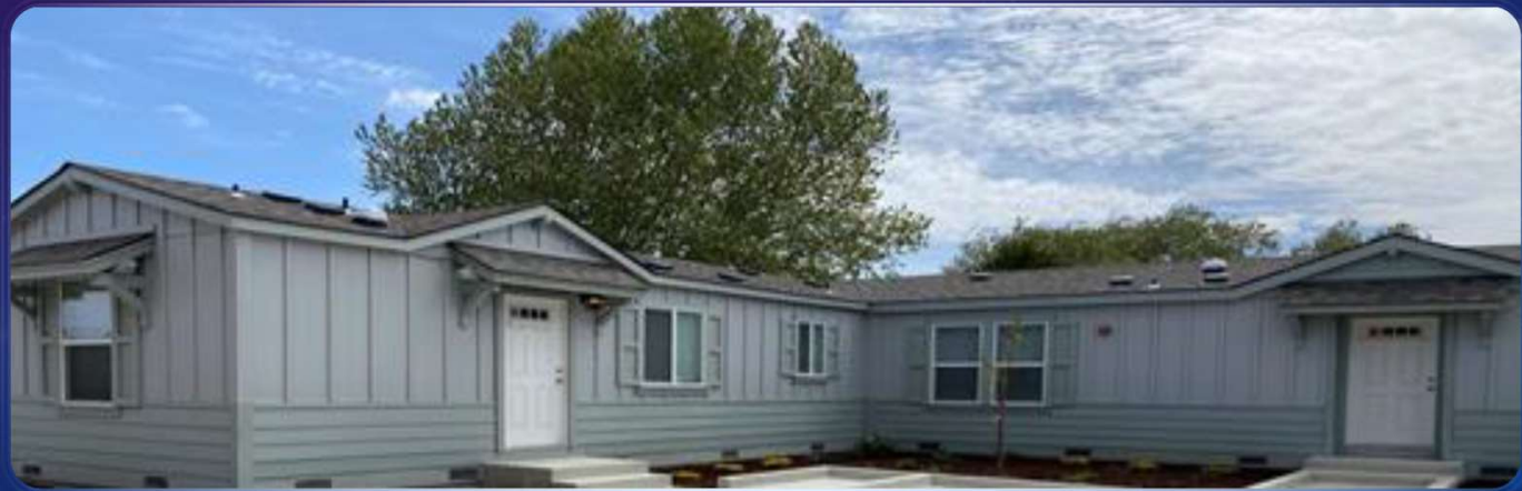
Sober Living Homes