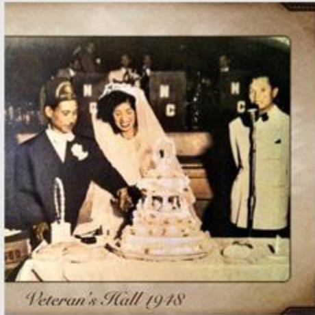
Veteran's Hall 1948