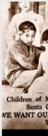
Children of M Santa C WE WANT OU