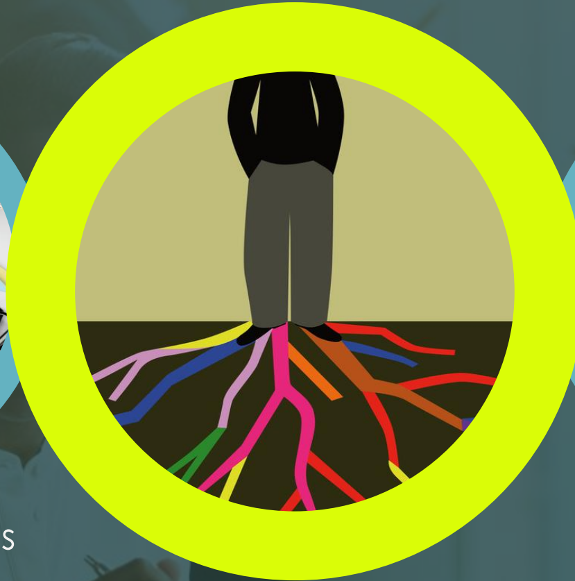
Chief Resilience Officer Management Analyst III $190k Annually; $950,000