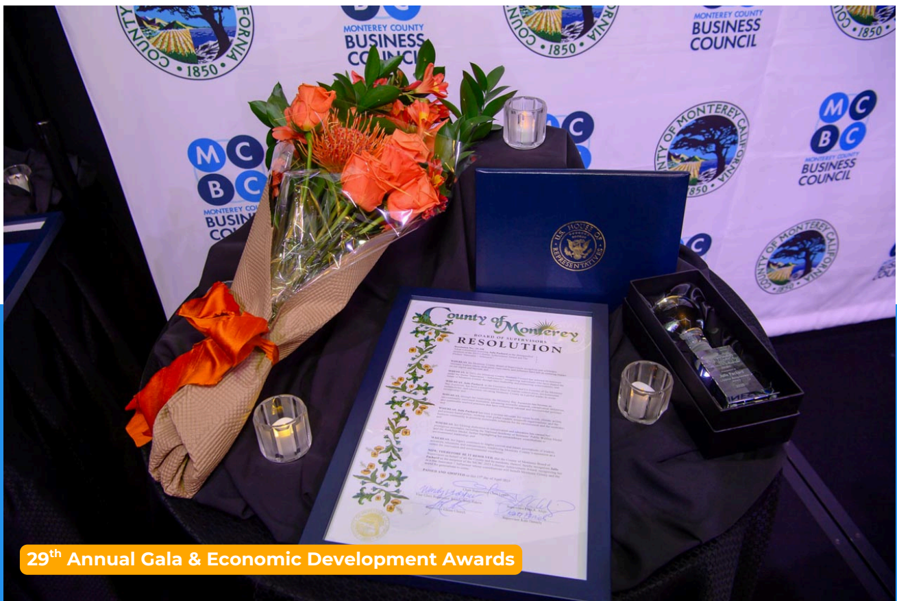
29 th Annual Gala & Economic Development Awards