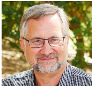
District 2 Supervisor Church