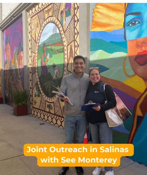
Joint Outreach in Salinas with See Monterey