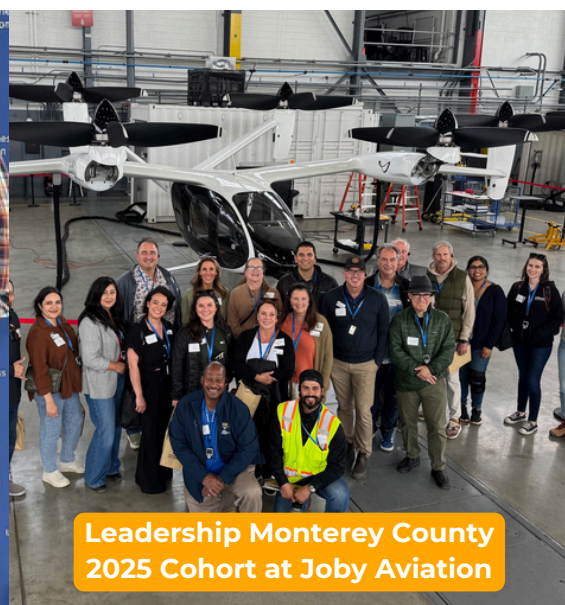
Leadership Monterey County 2025 Cohort at Joby Aviation