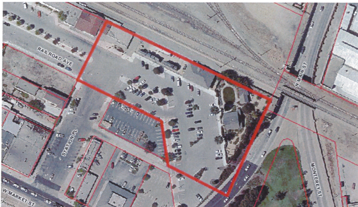
20-26 Station Place APN 020-172-012