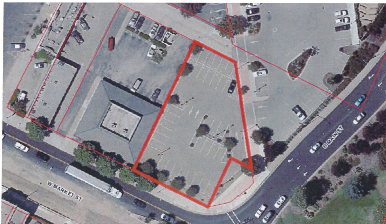
12 West Market Street