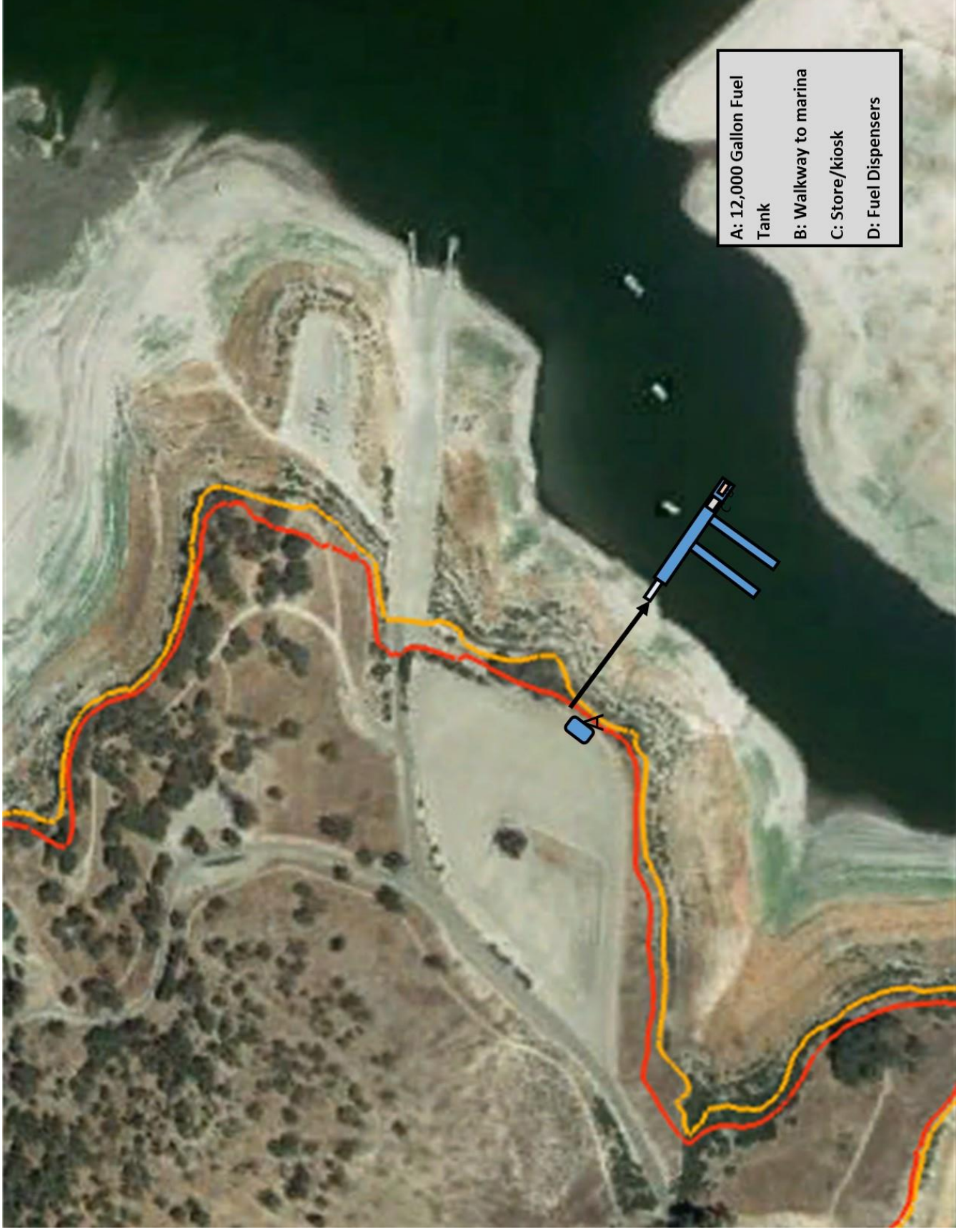
Site Map: Marina Project- Location Option Harris Creek