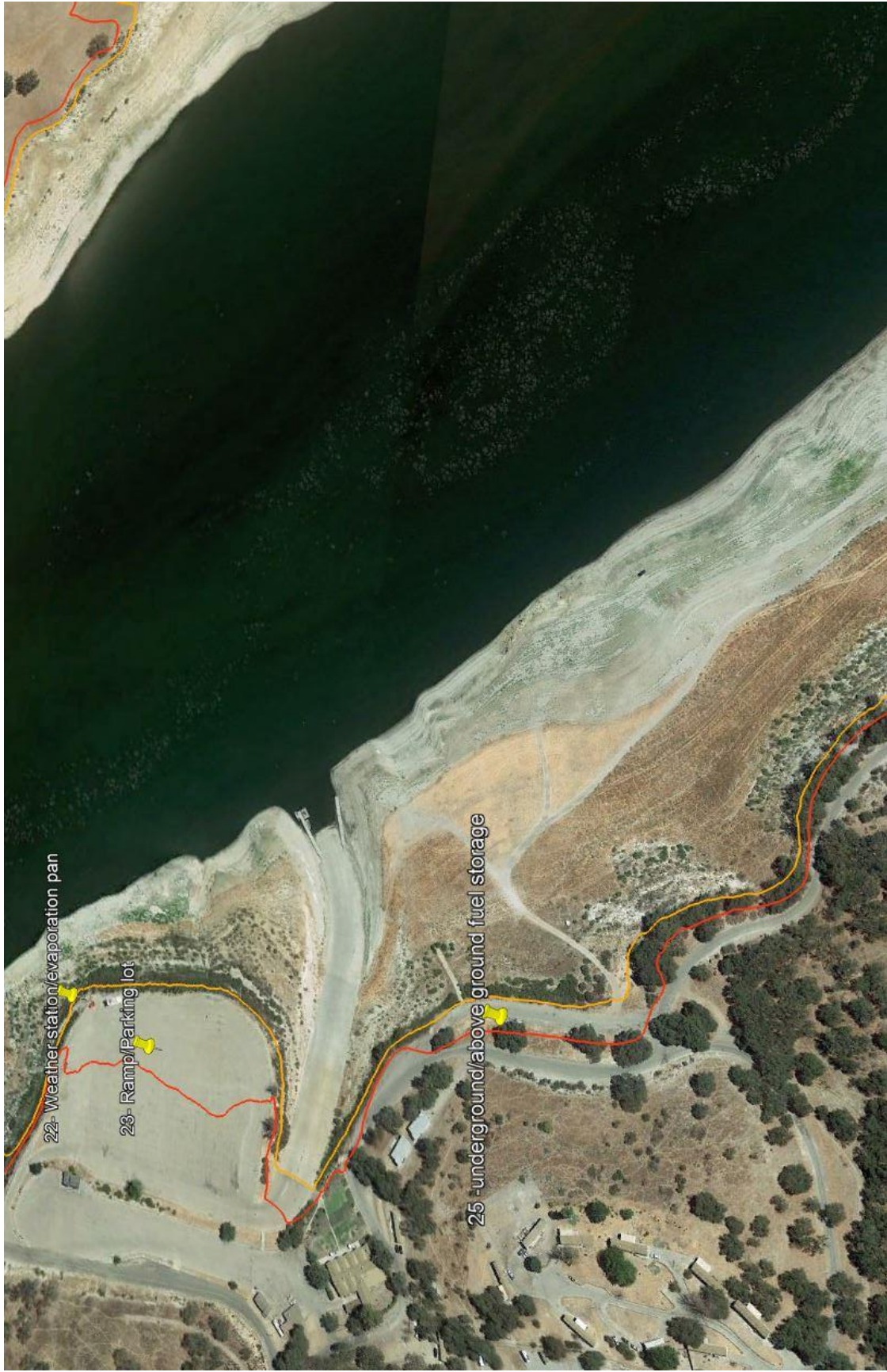
Site Map: Marina Project- Location Option Lynch