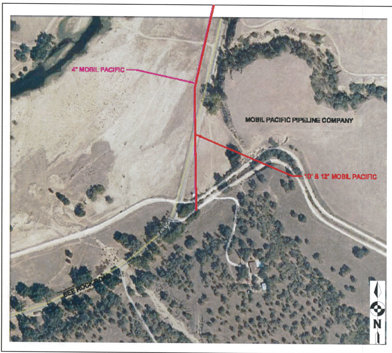
SOUTHEND MAP – MOBIL PACIFIC PIPELINE COMPANY