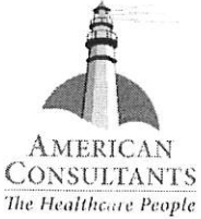
Exhibit A-1 per Amendment No. 1