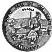
EDMUND G. BROWN JR. GOVERNOR