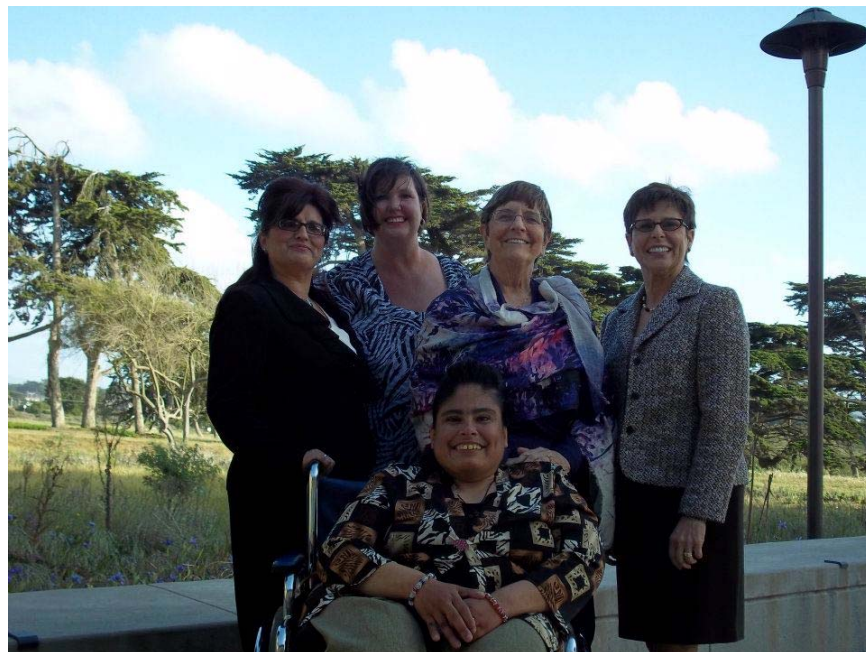
The 2012 event was fully funded by private donations and sponsorships.