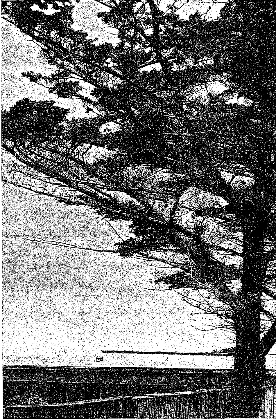
Image 2 Tree 3 Note the dying and dead wood on this tree